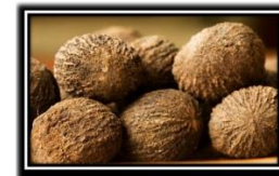
Black Walnut Festival

Call: 937-456-3999 • www.takepartinart.net Or contact 937-787-4256